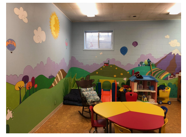
Pamela Rojas's art in the nursery