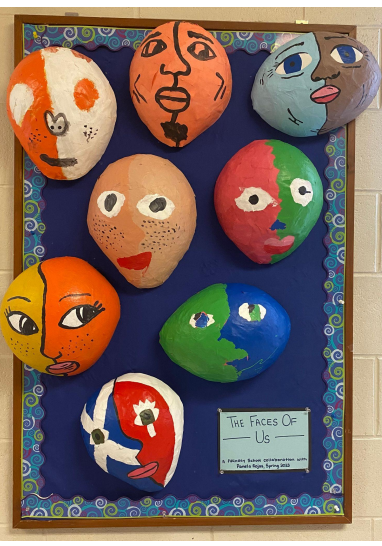
Faces of GRU