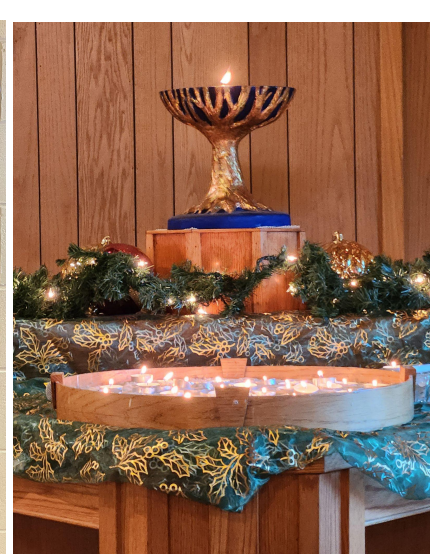
The GRU chalice at Christmas